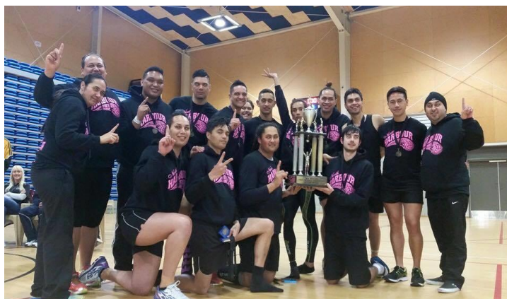
2015 Men's Netball Nationals A Grade Winners North Harbour with their trophy in Te Rauparaha Arena, Porirua.

NZMMNA congratulate the winners of this tournament and thank all teams and regions for making it a great competition once again. We are already planning the 2017 competition, which at this stage, is returning to Wellington. Watch this space for updates.